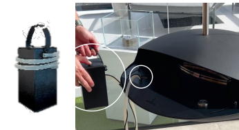
External Fuel Pump

The built-in sensor detects the temperature of the burner, which completely prevents refilling if the tank is still hot or in use. The bio burner is started quickly on the ignition button. This means that you completely avoid challenges with matches or lighters. The burner can easily be adjusted or switched off.